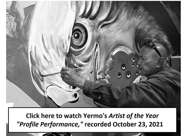
Click here to watch Yermo's Artist of the Year "Profile Performance," recorded October 23, 2021

“An Award to Recognize a Lifetime of Achievement”