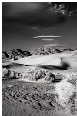
Untitled Photo on Metal $300