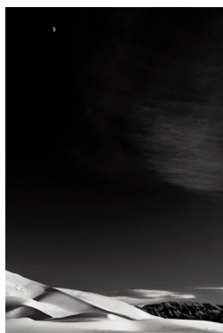
Untitled Photo on Metal $300