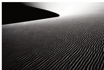
Untitled Photo on Metal $300