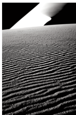
Untitled Photo on Metal $300