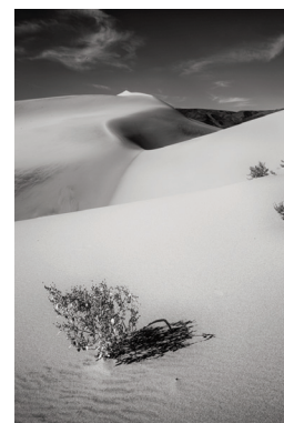
Untitled Photo on Metal $300

Please contact the artist for more information or to purchase: gary@garyfoto.com