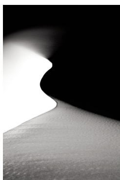
Untitled Photo on Metal $300

$100 from the sale of each of these photographs will go to support victims of the recent fire in Paradise, CA.