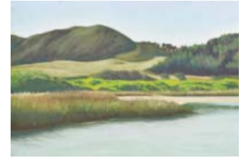
Morning at the Carmel River Mouth Soft Pastel $600