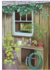
Looking Through Windows Soft Pastel $600