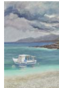
Passing Storm Soft Pastel $450