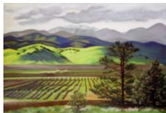
Vines to Snow Soft Pastel $1500