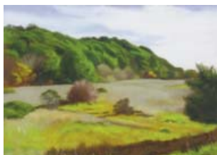
Wilder Meadow Soft Pastel $600