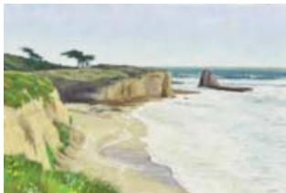
North Coast Beach Soft Pastel $600