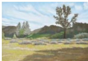
Pinnacles Meadow Soft Pastel $1400