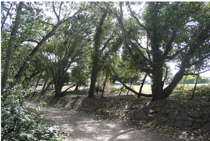
The house is visible now from the path and many invasive plants have been removed. 10 native trees and plants are now thriving.