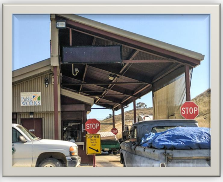
BUENA VISTA LANDFILL-BV