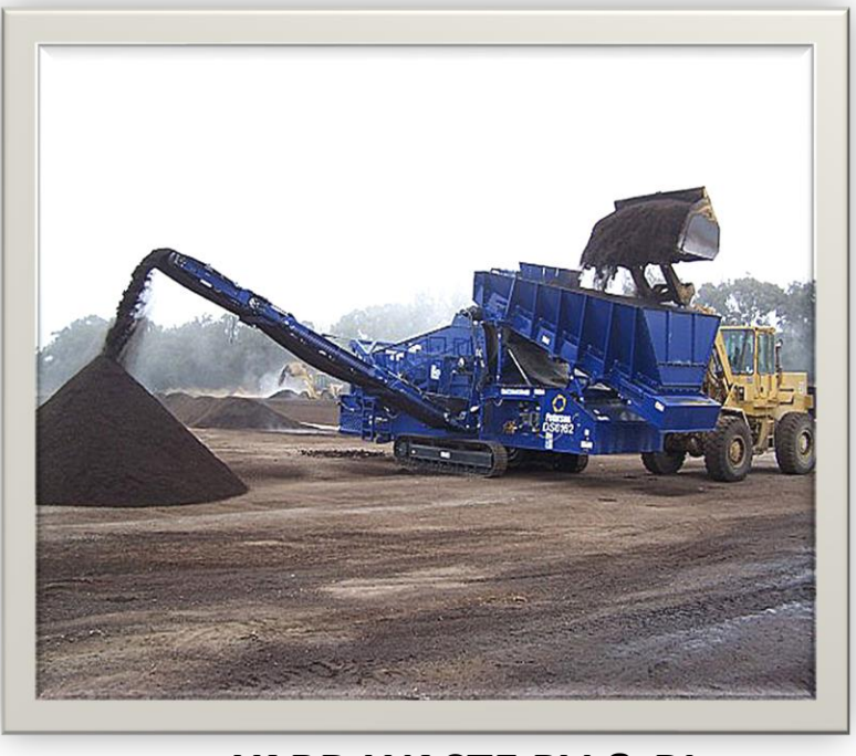
YARD WASTE BV & BL Keith Day, Inc.