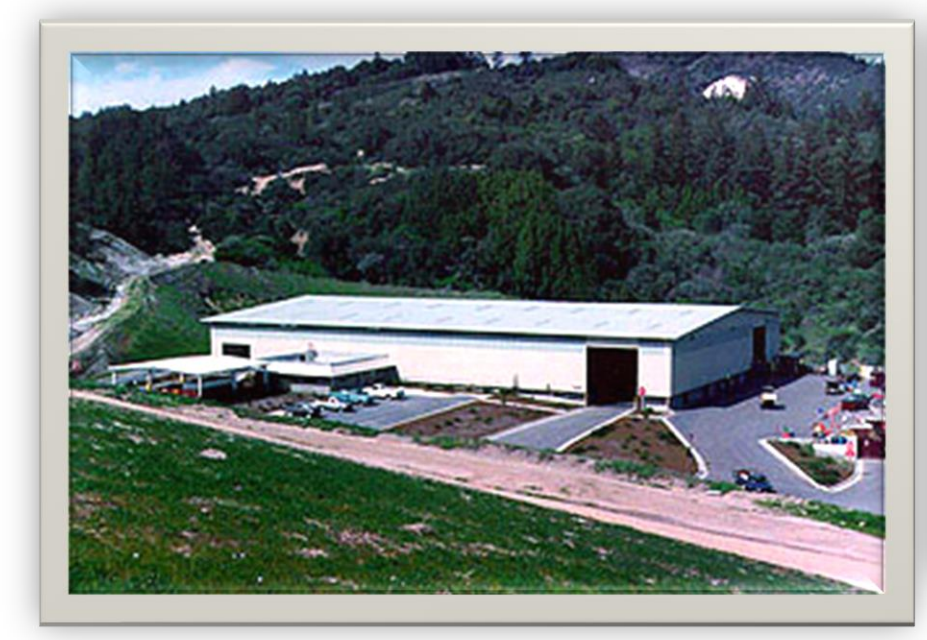
BEN LOMOND TRANSFER STATION-BL