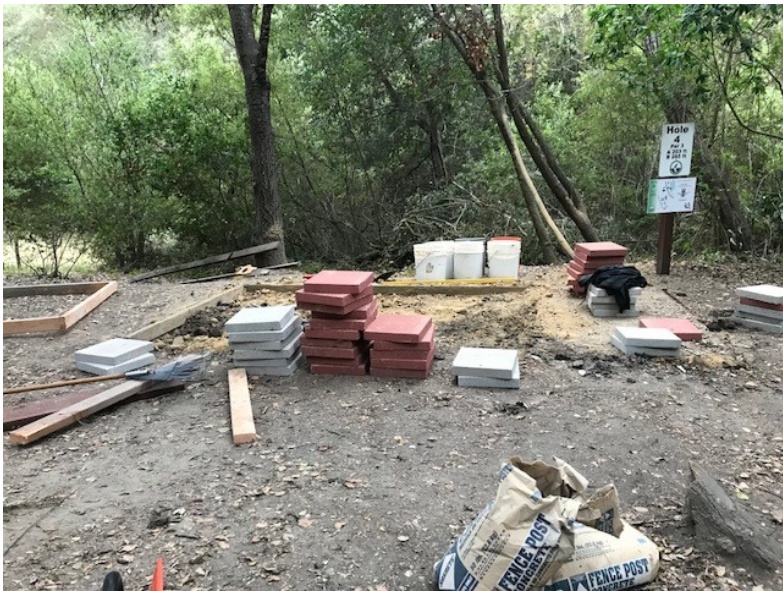
Material and prep for the new Tee on Hole 4!

Pinto Lake volunteers made a new tee for hole 4 on the Disc Golf Course. In August, volunteers logged over 20 hours keeping the course clean and ready for play, controlling weeds, and on graffiti abatement.