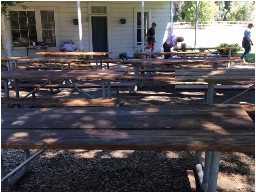
The finished product! All 10 picnic tables refurbished and ready for the next event!

The Granite Rock Fundraiser for Quail Hollow Ranch will be held on October 13^{th} 10 - 1:00 at the Granite Rock Quarry in Felton. Tours and Tacos for a $10 donation.