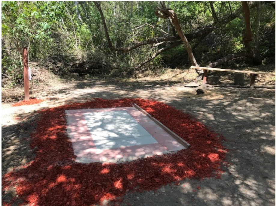
The finished product! Thank you Volunteers!

On September 22 Mountain Bikers of Santa Cruz organized a volunteer event for the new Bike Pump Track at Pinto Lake Park. There were over 26 volunteers from the Mountain Bikers of Santa Cruz, and Project Bike Tech. The volunteers helped spread mulch, installed erosion control material, dug troughs, and moved rocks.