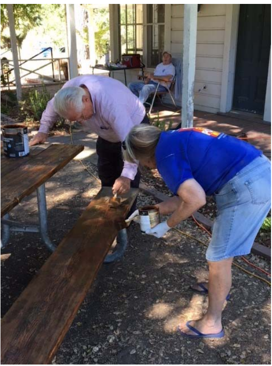
Applying finishing product

The San Lorenzo Valley Rotary Club volunteered at the ranch on a Sunday morning and sanded and finished the 10 the picnic tables we use for events. They look fresh and clean.