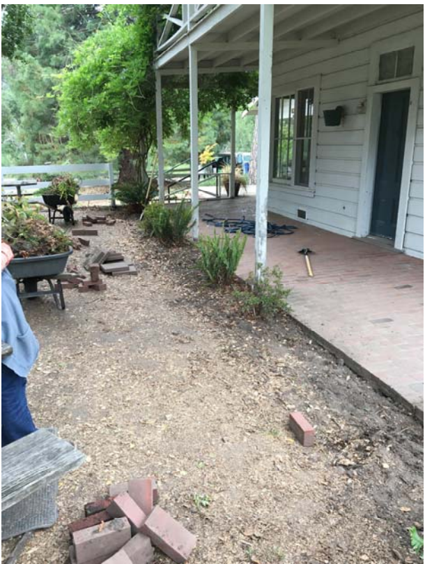
At the beginning of the project.

Two SLV Rotary members volunteered their time to renovate a planter area at the Quail Hollow House. They set a drip irrigation system, planted additional ferns, created a large pathway to the picnic area, spread mulch, reset the brick border, and cleaned up the existing plants. It looks beautiful!