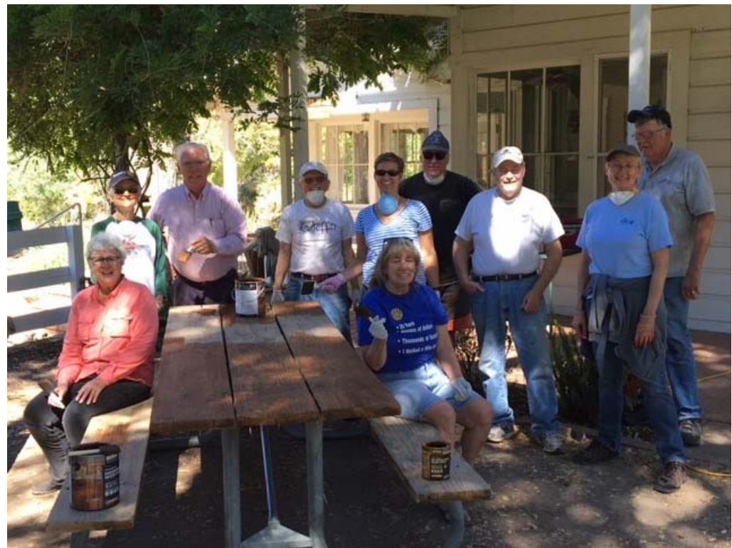
The group! Thank you!