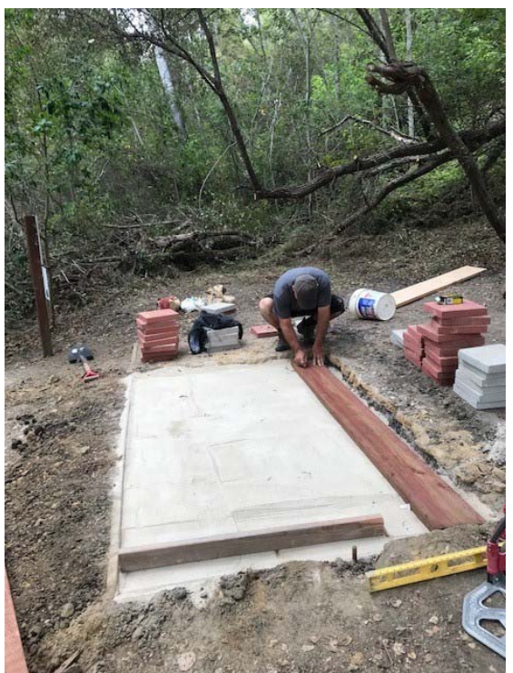
More prepping and getting it level.