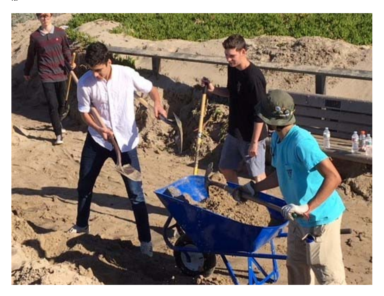
Tau Kappa Epsilon Fraternity hard at work shoveling and removing over 3 feet of sand from the ADA platform at Scott Creek Beach!

keep it accessible. They will also routinely work at keeping the park graffiti free, maintaining the bulletin board, picking up trash and removing invasive ice plant from the dunes so that the Snowy Plover will thrive. After the fraternity spent two mornings (9:00 a.m.– 1:00 p.m.) at Scott Creek Beach, shoveling and hauling sand, they felt compelled to commit to the park and adopt it.